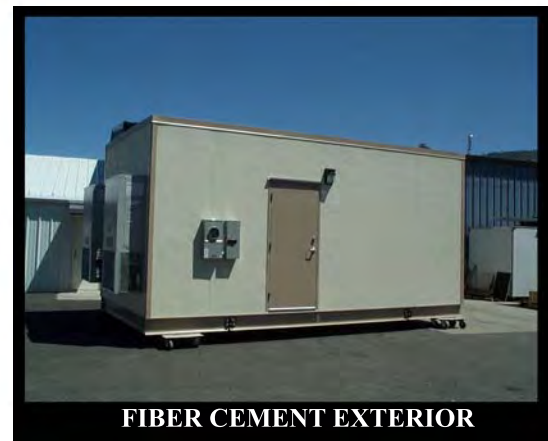
FIBER CEMENT EXTERIOR