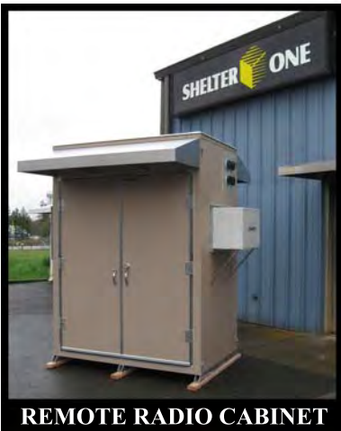
REMOTE RADIO CABINET