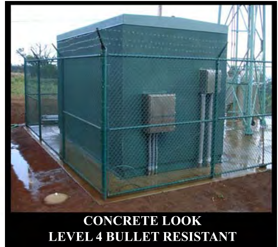
CONCRETE LOOK LEVEL 4 BULLET RESISTANT