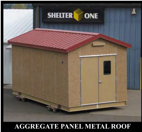
AGGREGATE PANEL METAL ROOF