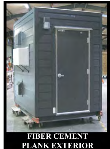
FIBER CEMENT PLANK EXTERIOR