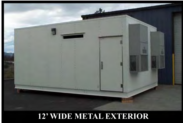
12' WIDE METAL EXTERIOR