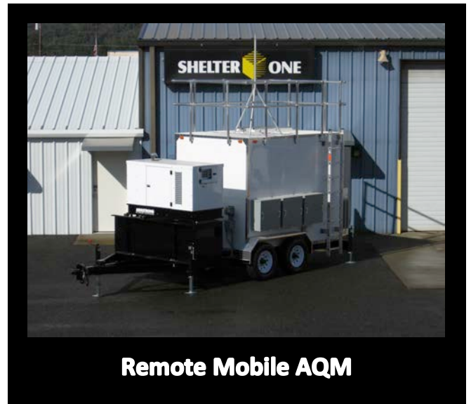
Remote Mobile AQM

Shelter One 5887 Monument Drive Grants Pass OR 97526