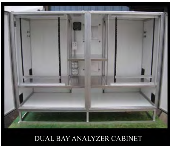
DUAL BAY ANALYZER CABINET