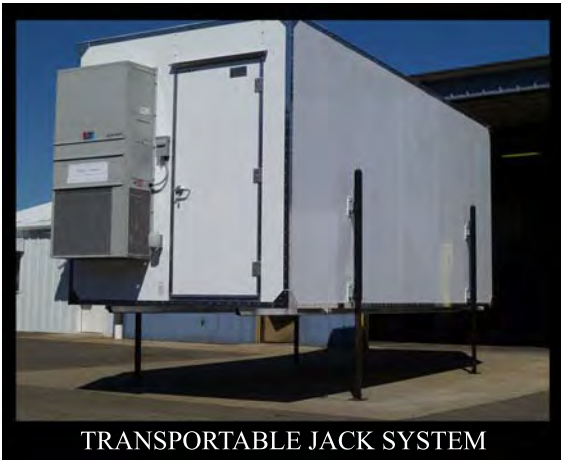
TRANSPORTABLE JACK SYSTEM