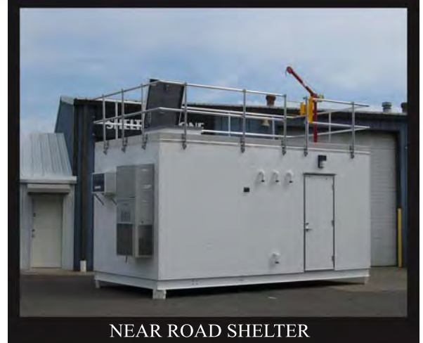
NEAR ROAD SHELTER