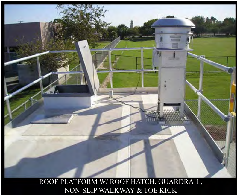
ROOF PLATFORM W/ ROOF HATCH, GUARDRAIL, NON-SLIP WALKWAY & TOE KICK