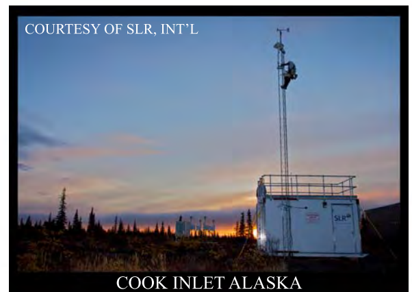
COOK INLET ALASKA