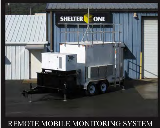
REMOTE MOBILE MONITORING SYSTEM