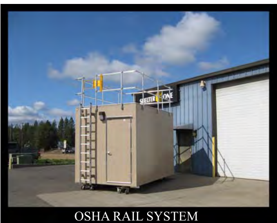
OSHA RAIL SYSTEM